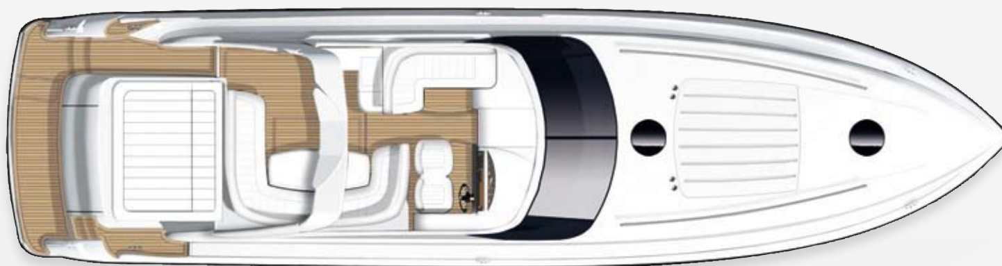
Upper accommodation layout